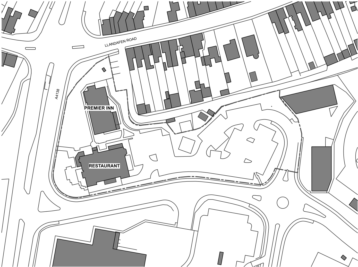
01 Location Plan Scale: 1:1250