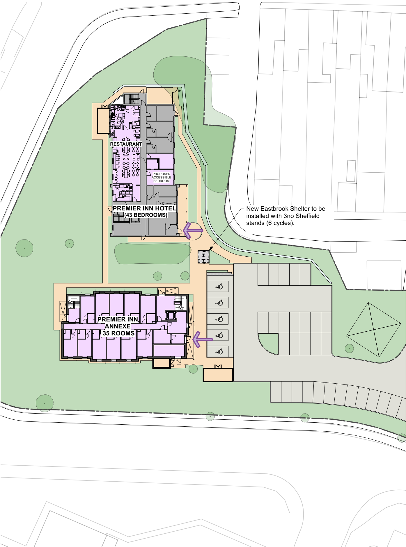
01 Proposed Site Plan Scale: 1:500