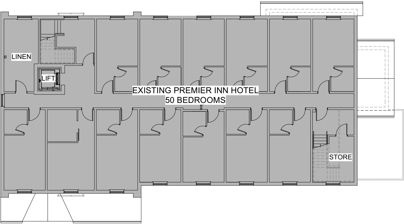
01 Existing Third Floor Plan Scale: 1:200