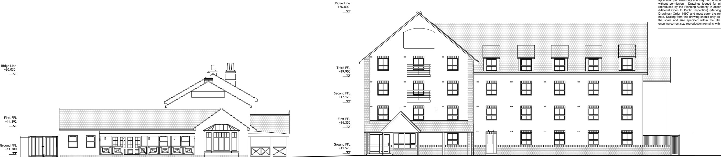
01 Existing East Elevation Scale: 1:200

This drawing is the copyright of Axiom Architects. It is for planning application purposes only and may not be reproduced in whole or in part without permission. Drawings lodged for planning approval may be reproduced by the Planning Authority in accordance with the 'Copyright (Material Open to Public Inspection) (Marking of Copies of Plans and Drawings) Order 1990' and must carry the relevant copyright restriction note. Scaling from this drawing should only be carried out from a print at the scale and size specified within the title block. Responsibility for ensuring correct size reproduction remains with the reader.