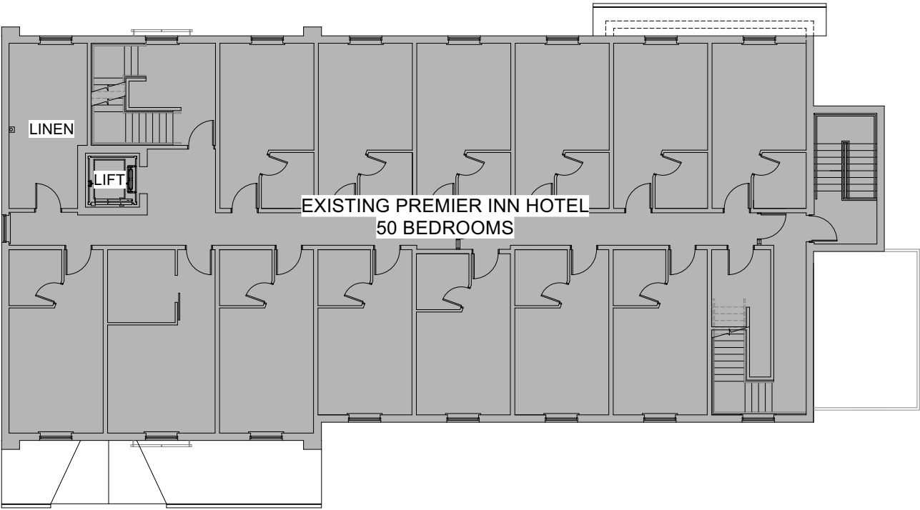
01 Existing Second Floor Plan Scale: 1:200