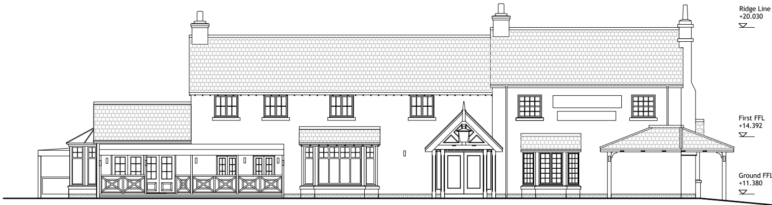
03 Existing North Elevation- Restaurant Scale: 1:200