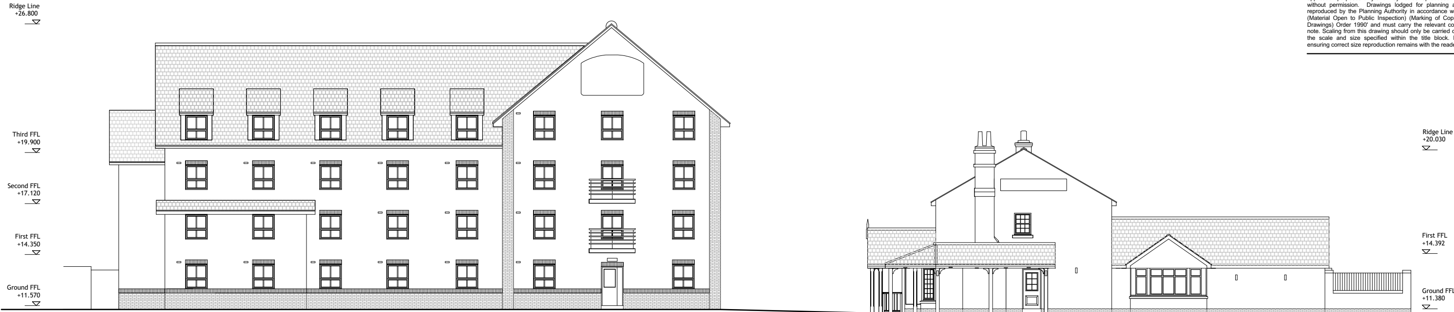
01 Existing West Elevation Scale: 1:200